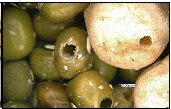
Fig. Damage symptoms in Cowpea seeds